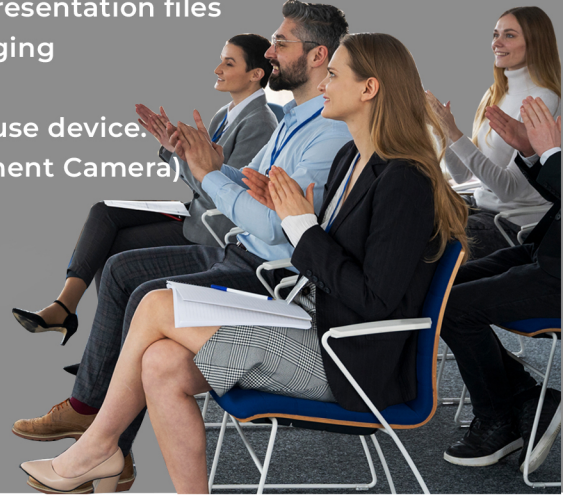
Easy to Extend to the Large Display